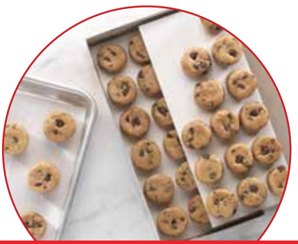
Each 2.5 lb. box contains 36 1.1 oz. gourmet frozen cookie dough pucks